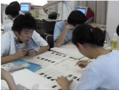
Fig.1. Group Collaboration.