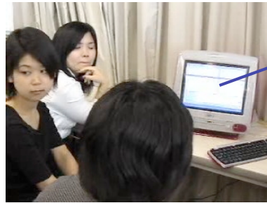
Fig. 2. Experiencing the Virtual Tour on the Internet.